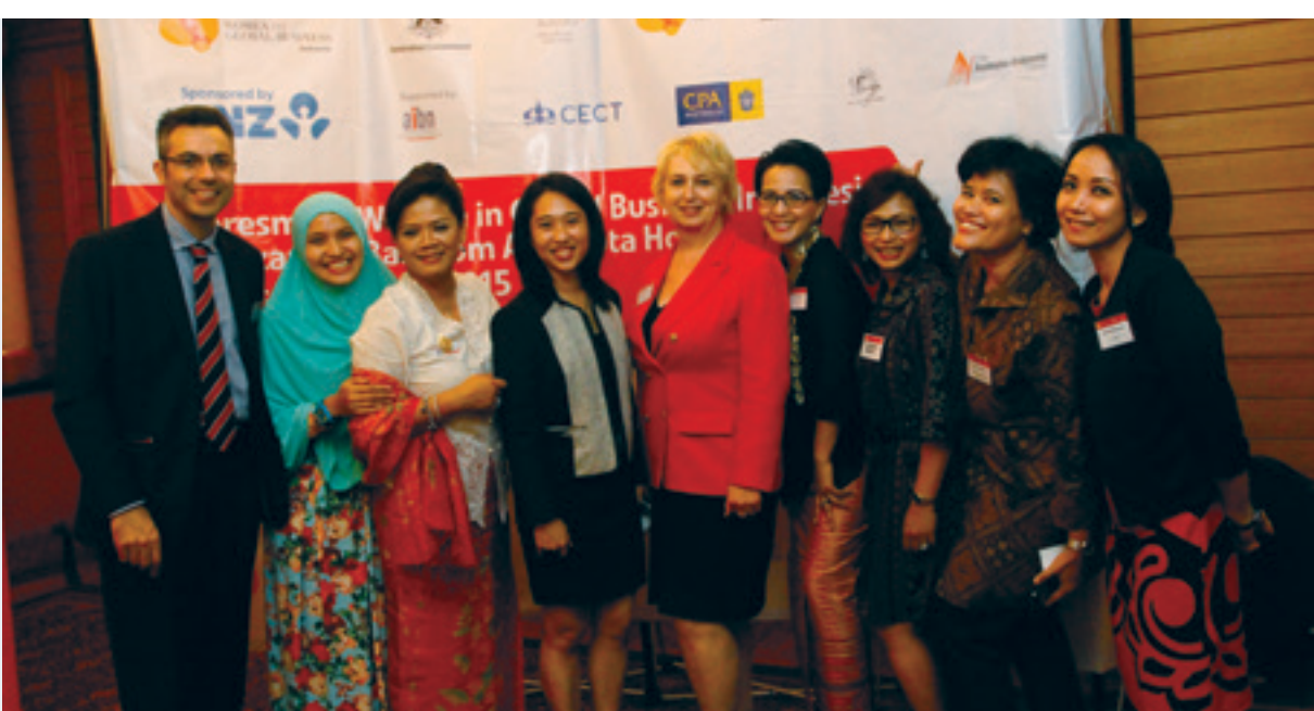
Launch of Women in Global Business Indonesia.

More information: http://www.wigb.gov.au/